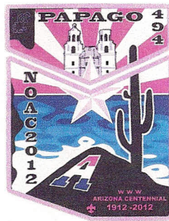
FUND RAISER Copper